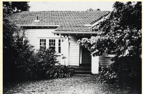
THE PELLING HOUSE - 1926 - LOTS 12 x 19

Some of the items we received from from the late Pat Wallis collection.