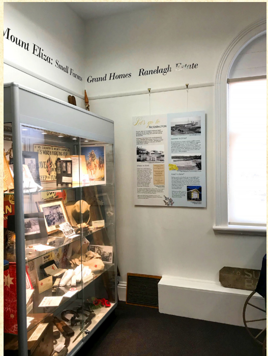
Some of the new lettering and the Panel about tourism in the Mornington area.