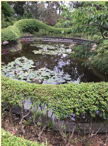
The lily pond in the peaceful Japanese Garden at Beleura.

Memberships from next year will be single $30 and Couple/family$40 and coffee mornings $10 per person for a great speaker, morning tea and a door prize and some good chats.