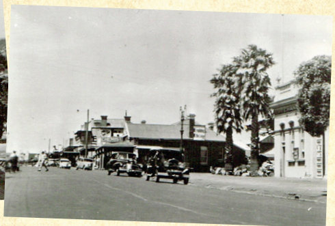
Main Street, Mornington