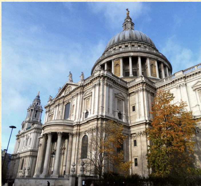
St. Pauls Cathedral in the Autumn.

We made our way home through Paternoster Square towards St. Paul’s station a few early autumn leaves fell, quietly whispering as the breeze gently blew them away.