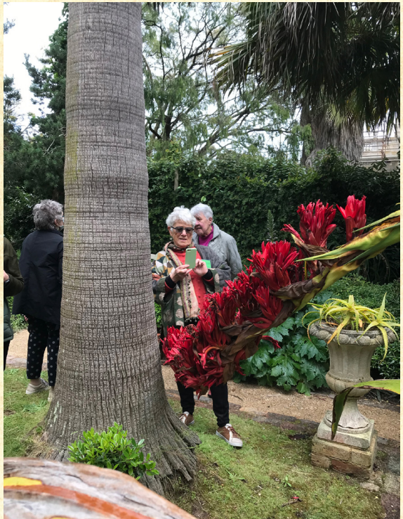
The spectacular Giant Spider Lily which only flowers every ten years.

The committee has decided reluctantly that we need to put up our memberships and cost of coffee mornings. We have not raised prices for a number of years, but our costs have been increasing and it has become harder to break even.