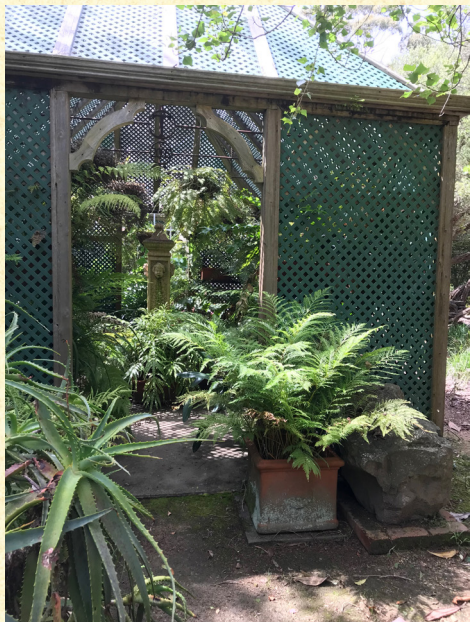
The beautiful dappled light in the Fernery at Beleura.