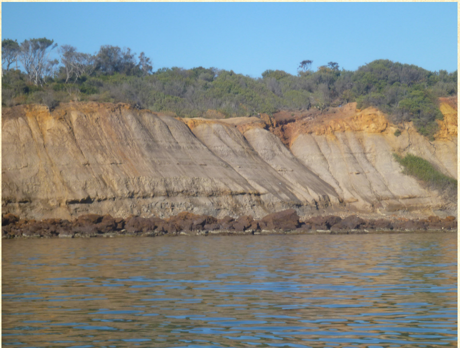
The cliffs at Fossil Beach in the Balcombe Clay layer showing the grey Gellibrand Marl