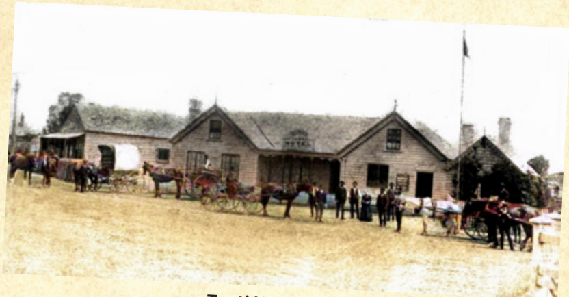
Tanti Hotel c1900.