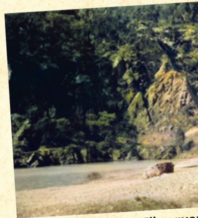
Mt. Eliza qua