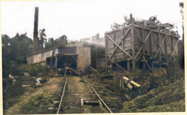
Mt. Eliza quarry building.