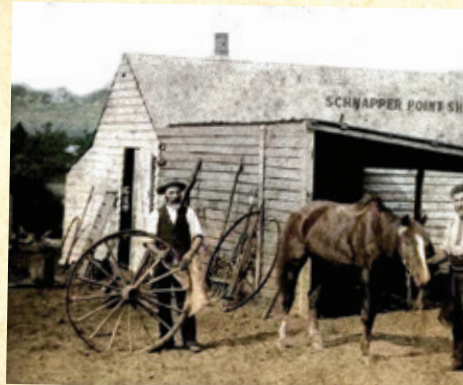
Jenkins Schnapper Pt

We put our speakers up on our website or on Facebook, particularly if short notice. Until we can overcome COVID 19, cancellations may occur with Government regulations.