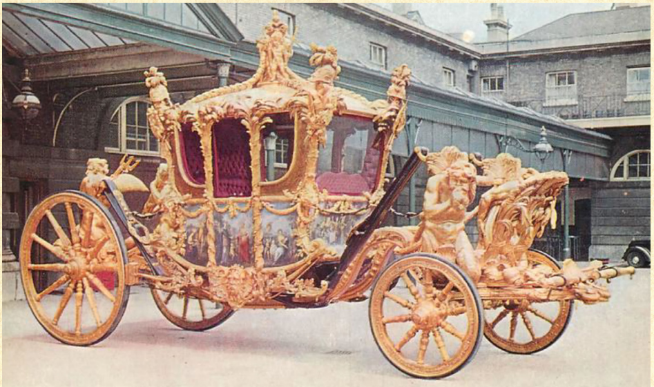
The above picture is of the Gold Coach, which had paintings on its sides by the Italian painter Cipriani. The springing can be seen stretching from the back to front - leather straps! Also the house, on the left in the corner above - the one with the air raid warning box above it, was our house/flat for many years

The remainder of this article will appear in the next newsletter