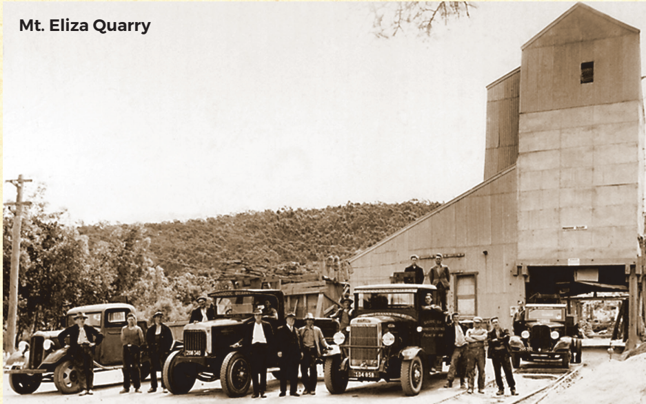
Mt. Eliza Quarry