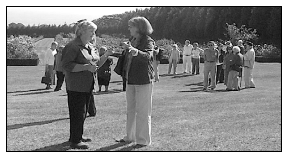
A beautiful day at Sunnyside