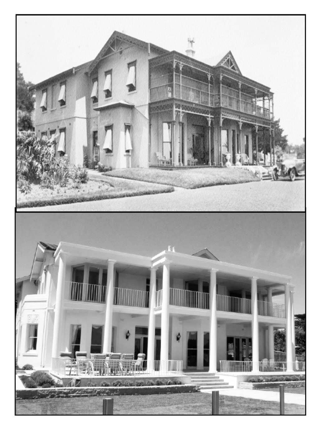
Rubra 1930s (top) and in modern times (above)