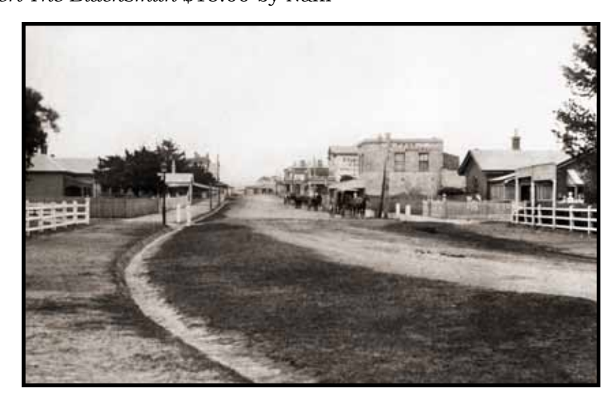
Main St as it was at the time of the 1892 Football Disaster