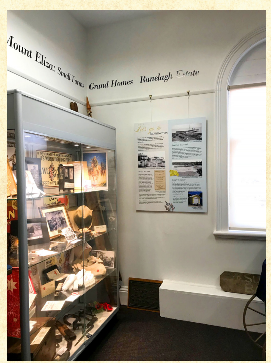
Some of the new lettering and the Panel about tourism in the Mornington area.