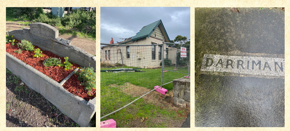
Bills' Horse Trough.