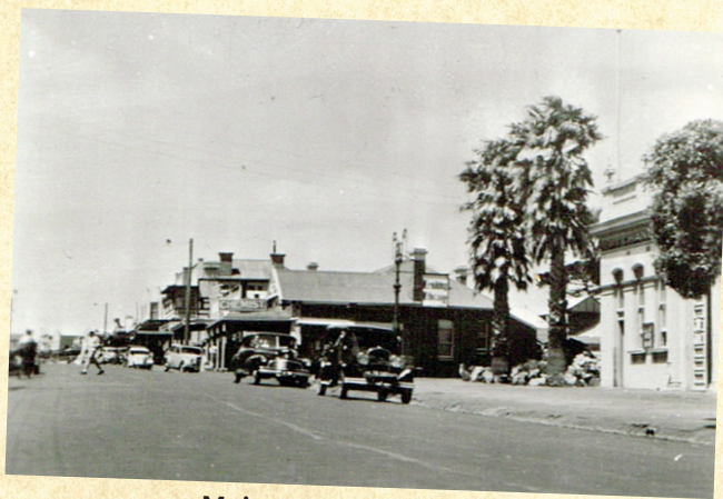
Main Street, Mornington