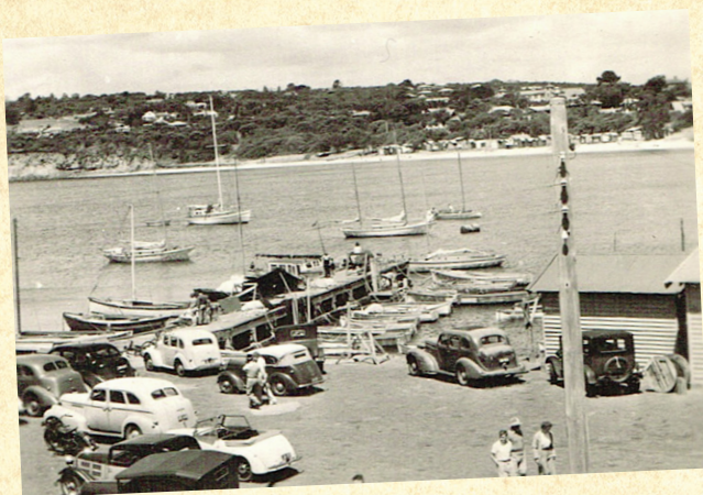
Yacht Club, Mornington