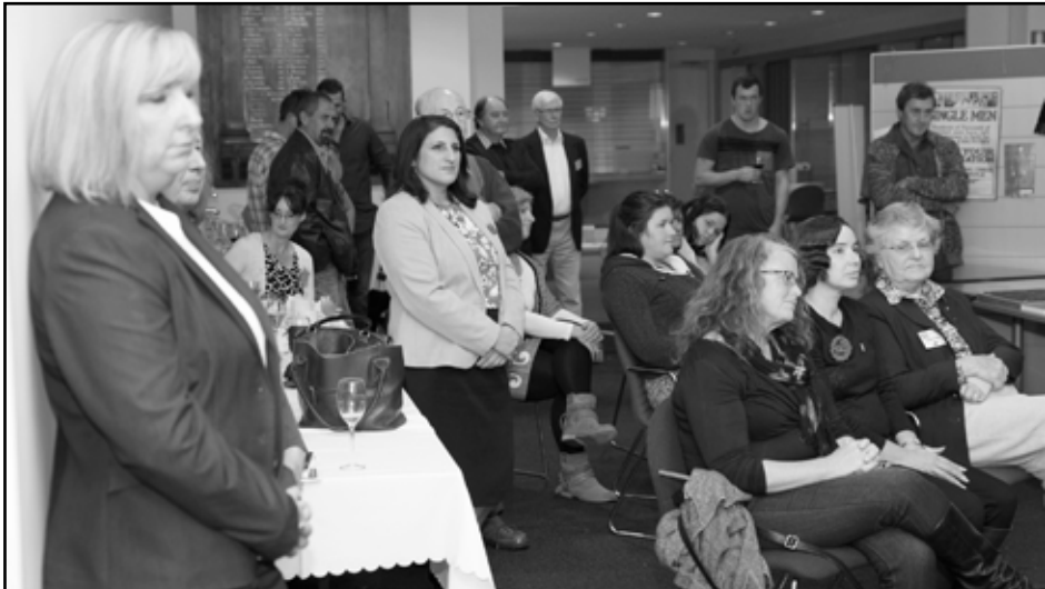
Section of the audience at the book launch April 24

We hope you enjoy your membership with us.